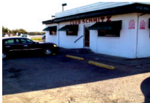
Former Harry Hines Golf & Country Club 19th Hole.

It doesn't get any better. Stay tuned for the time and date for the first official get-together. All this is designed to share some real camaraderie, especially involving new members and make new rowing friends. The most important thing is, we are a club and NEVER FORGET IT.