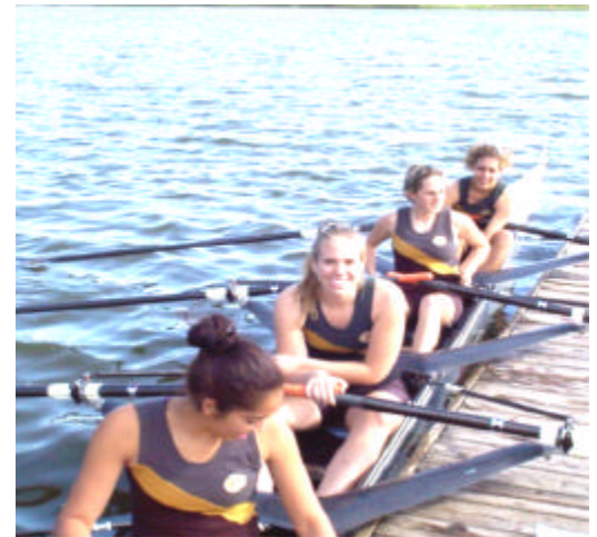
A Greenhill School Girls quad readies to leave the DRC dock for an afternoon's training session.

Each School will average 20-22 rowers except Cistercian which will have about one half that number, so the boathouse has about 100 people