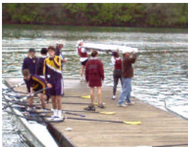
Juniors Preparing to Launch