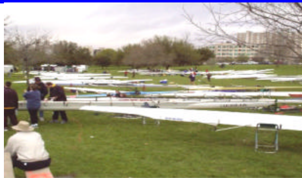
A HOST OF SHELLS COVERED THE REGATTA SITE