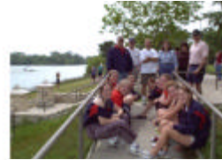
The Ursuline Girls