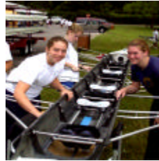
Getting Race Ready