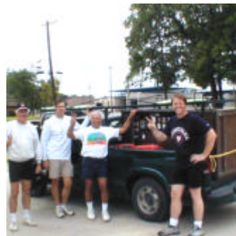
The engineering group that planned the mounting of the coke box for transfer to the dump.