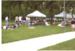
Parents know how to make spectating fun.

Texas junior teams from Dallas, Woodlands and Austin met in Waco on the Brazos on April 21st for an informal scrimmage before their official state championship the following weekend at the ARC/Town Lake course.