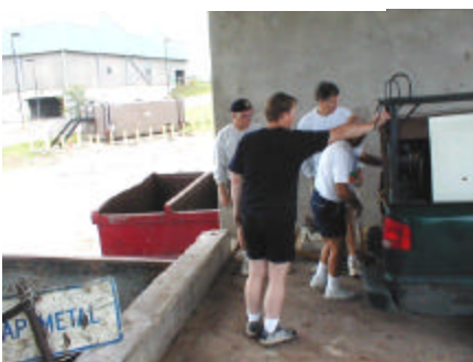
Cokebox Pallbearers assembling for duty